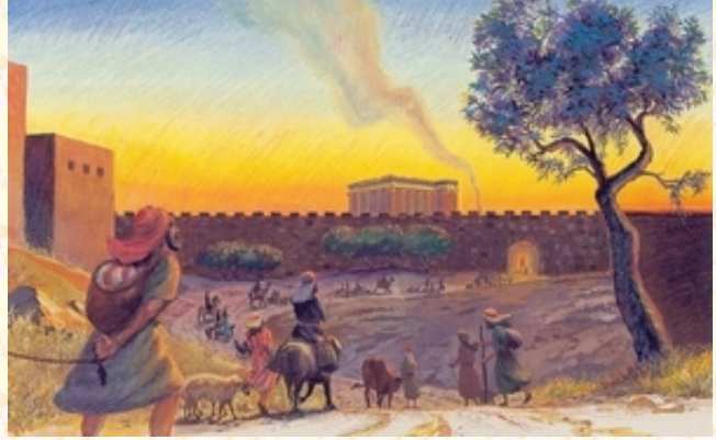
Image from the CD 'Yeshua' from 'Music for Messiah', some wonderful Messianic music by 'Jews for Jesus'. Click the image to go to their website.