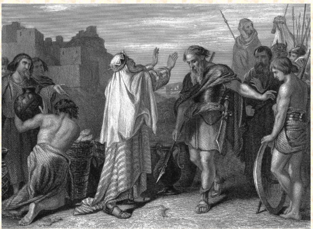
The meeting of Abraham with Melchizedek.

The Dual Offices of the Coming Messiah as Priest and King